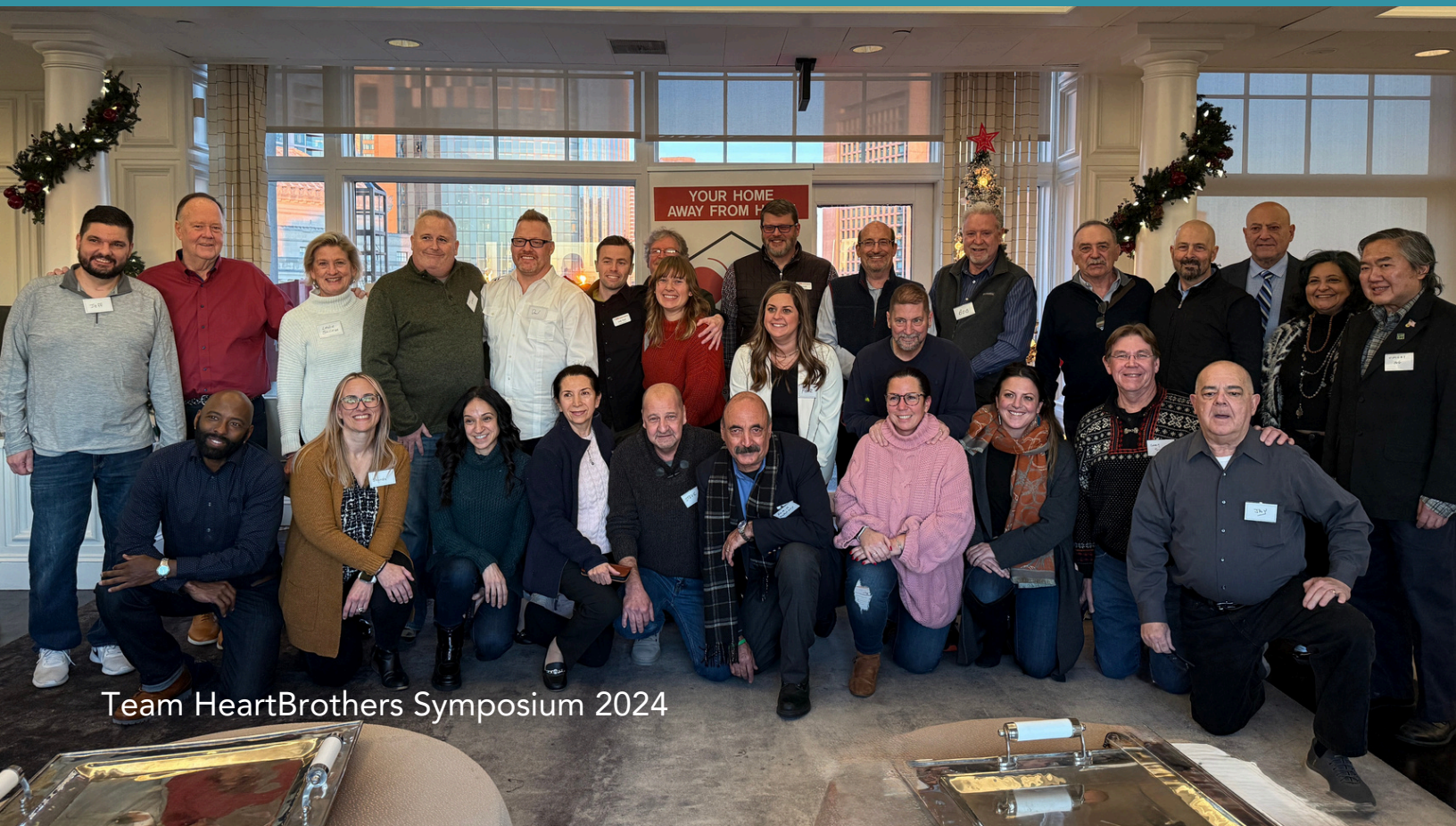
Team HeartBrothers Symposium 2024

LATEST INFORMATION AND UPDATES ABOUT HEARTBROTHERS FOUNDATION